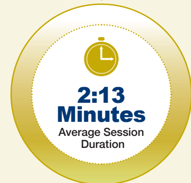
Based on 2025 Data